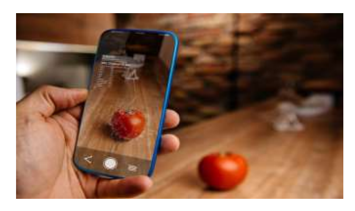
Mobile device AR

2.Furthermore, accessibility is becoming more crucial in UI/UX design. With the increasing use of technology by individuals with disabilities, designers are emphasizing the need of building interfaces that are useable by everyone, regardless of their ability. This entails designing for various devices, settings, and situations, as well as ensuring that interfaces are not just simple to use but also easy to comprehend.