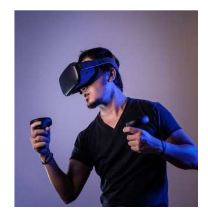
A man wearing a virtual reality headset