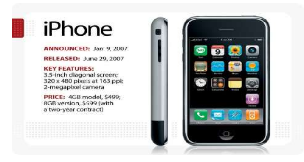
The first iPhone from 2007