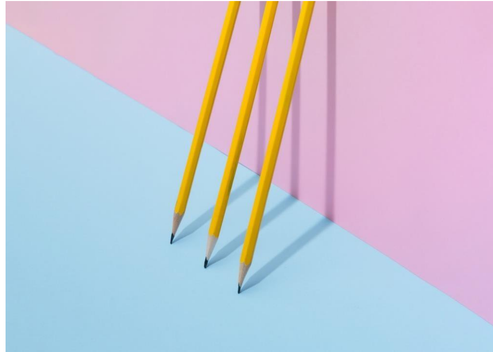
Diagram for Lighting & Shadows:

Analyzing Aesthetics as per laws of Design principles / 19CSE315 UI/UX Design/ / N Selvakumar /CSE/SNSCT