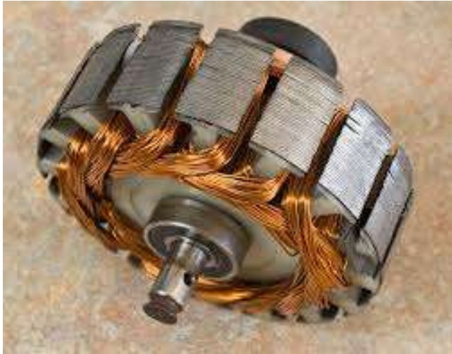
Armature core (rotor)