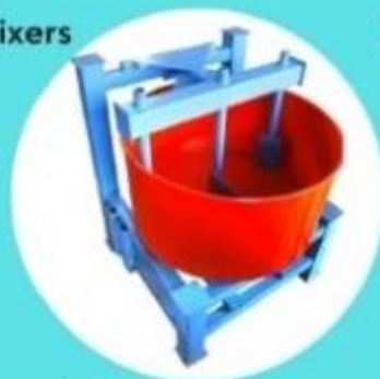
4. Pan type mixers