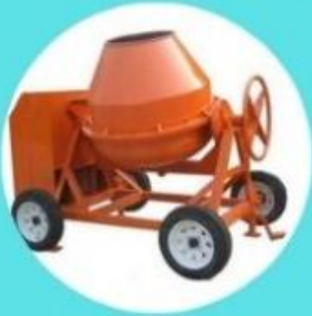
1. Tilting drum mixers