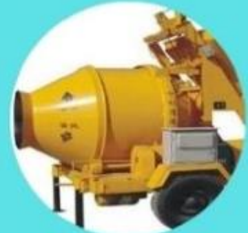
3. Tilting drum mixers