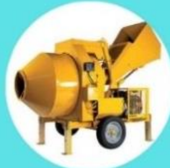
2. Non-Tilting Drum Mixers