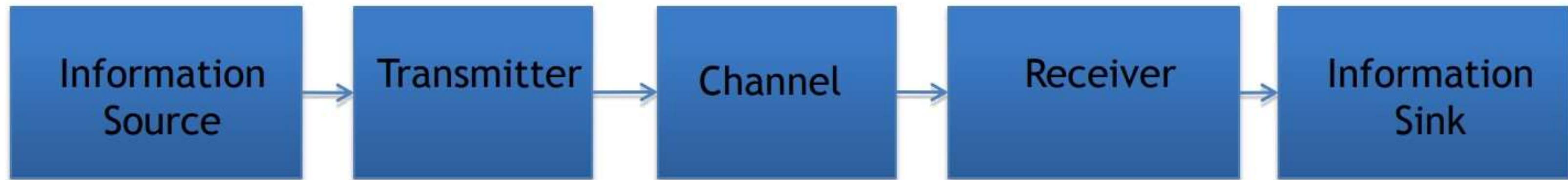
Block Diagram of a typical communication system