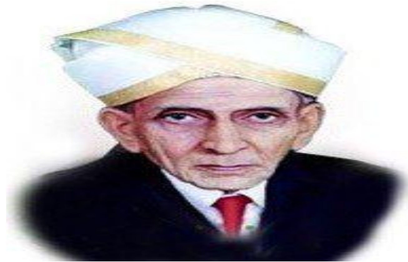
Bharat Ratna Mokshagundam Visvesvaraya (15 September 1860- 14 April 110620) •The father of Indian engineering •Engineer's day In India