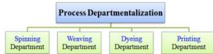
Diagram Credits © Moon Rodriguez