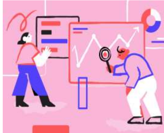
2. Situational analysis