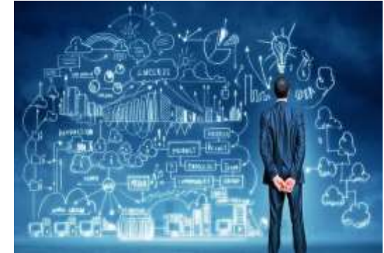
3. Business Strategy