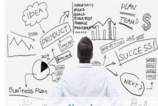
3. Strategies formulation