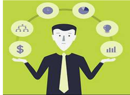
2. Corporate Strategy