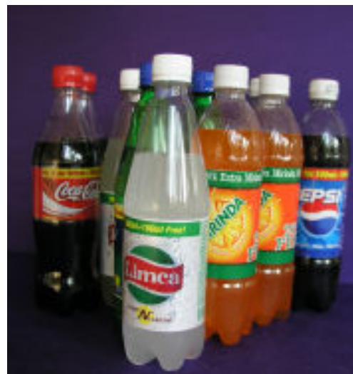
Fig. 7.3. PET bottles for carbonated soft drinks