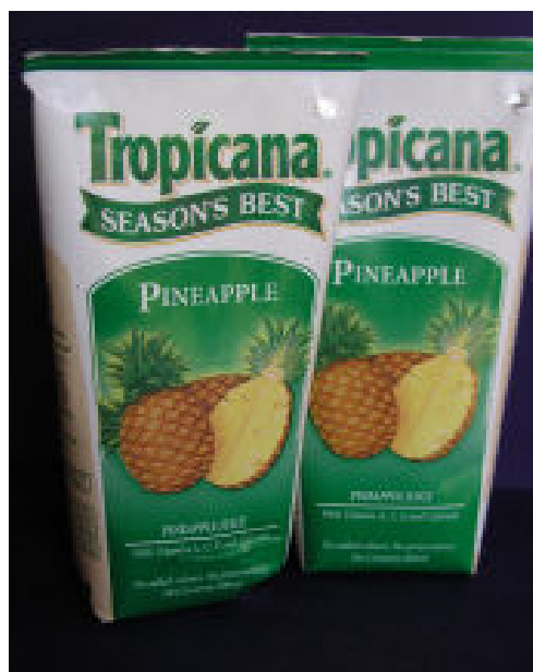
Fig. 7.1. Aseptically packaged fruit juices