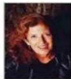
Dame Anita Roddick (1942-2007)

“A business that makes nothing but money is a poor kind of business”