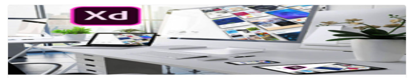
Adobe XD Mobile & Web UX/UI For Dummies: Quick Crash Course!