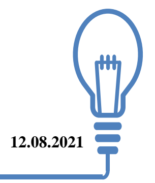
P.Ramya/AI & Machine Learning/19EC503/K-Means Clustering