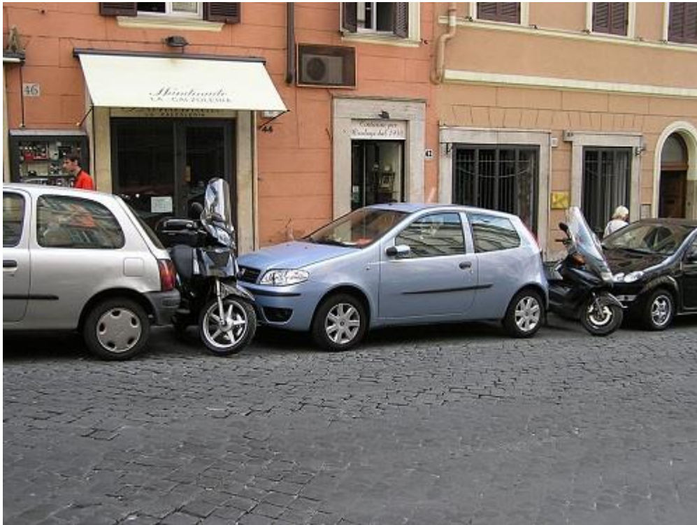
Parallel Parking Angular Parking

Parking. Therefore, more number of vehicles can be parked in this Parking System. For this reason, this Parking system is generally adopted.