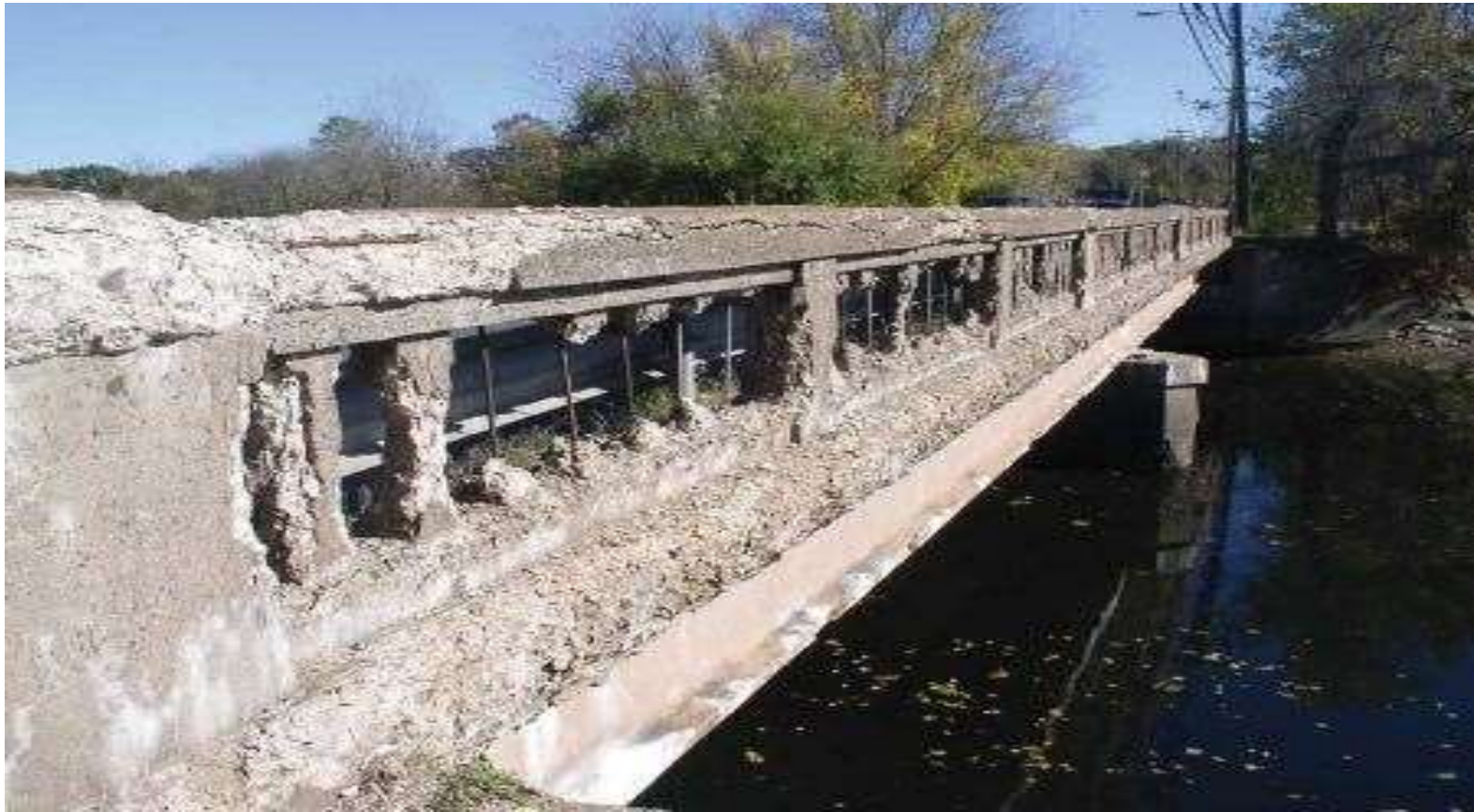
Fig 4: Freezing and Thawing Effect on Concrete