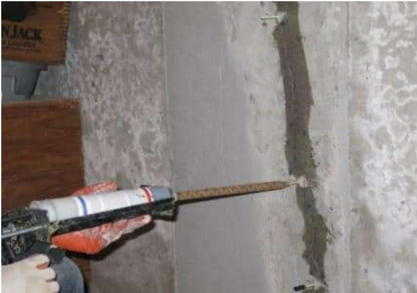
Fig 10: Grouting