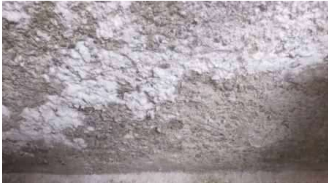
Fig 13: Concrete affected by Fungi