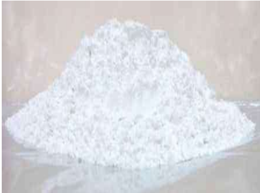
Fig 2: Retarding Admixture (Gypsum)