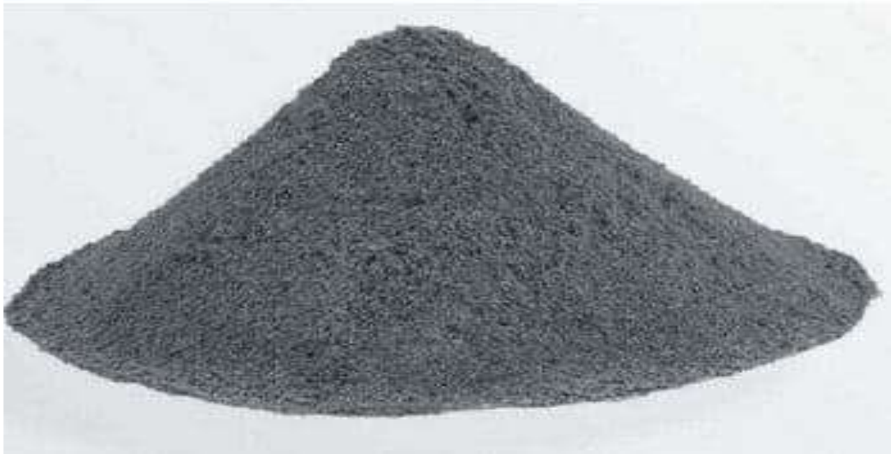
Fig 3: Accelerator (Silica Fume)