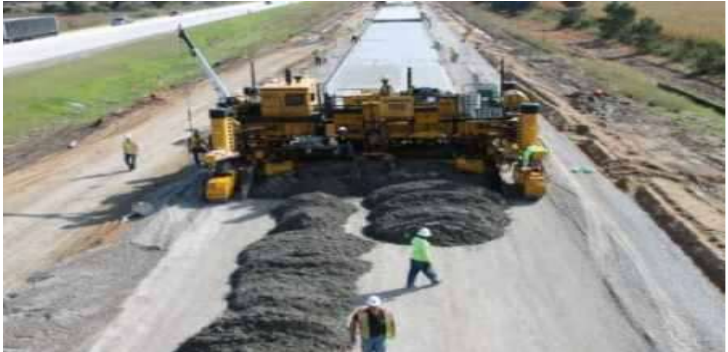
Fig 12: Concrete Pavement Overlay