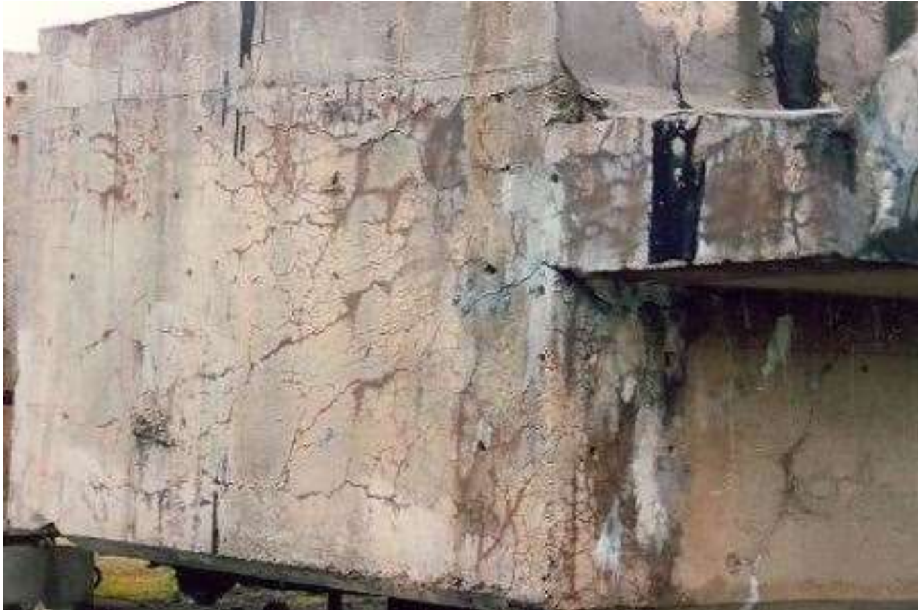
Fig 8: Effect of Alkali Aggregate Reaction on Concrete