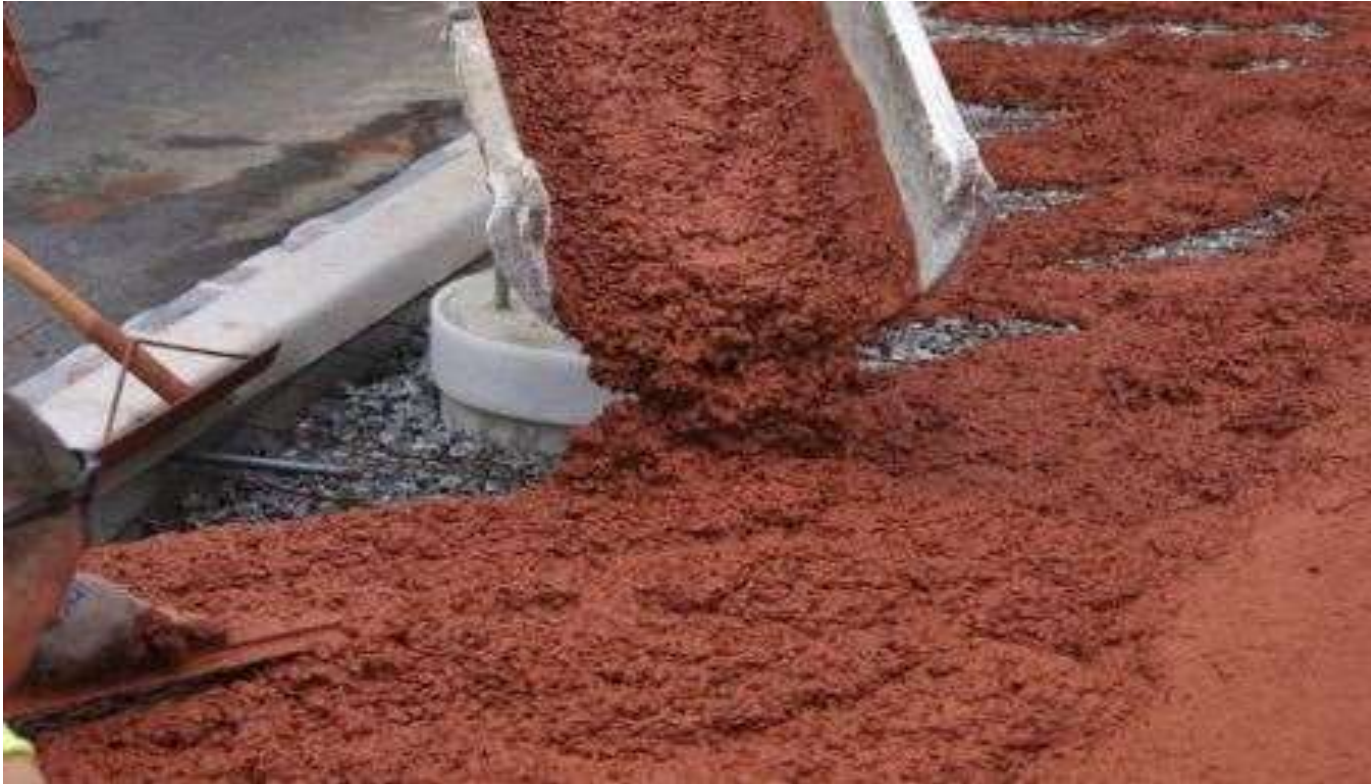
Fig 14: Colored Concrete