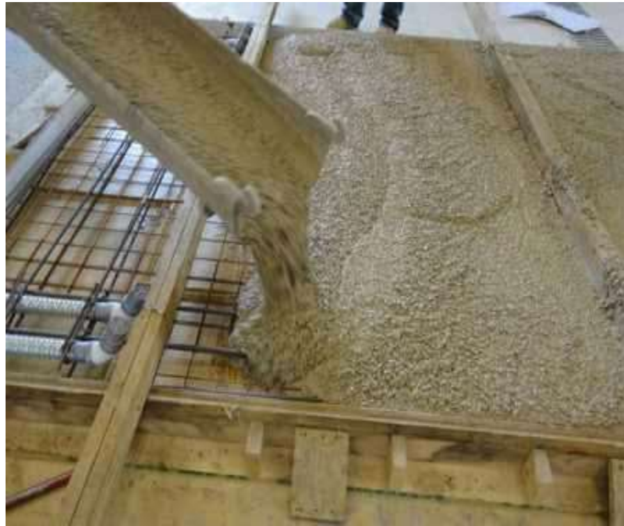
Fig 1: Water Reducing Admixture