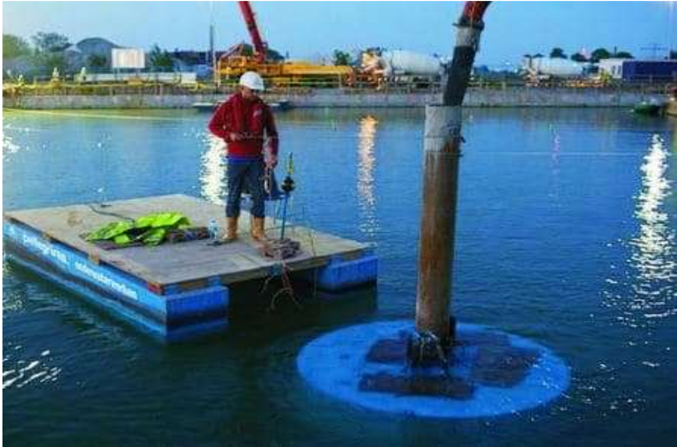
Fig 9: Underwater Concreting