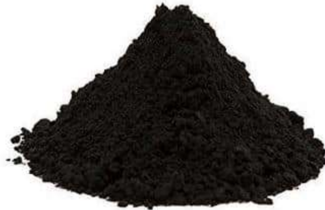
Fig 7: Activated Carbon Powder