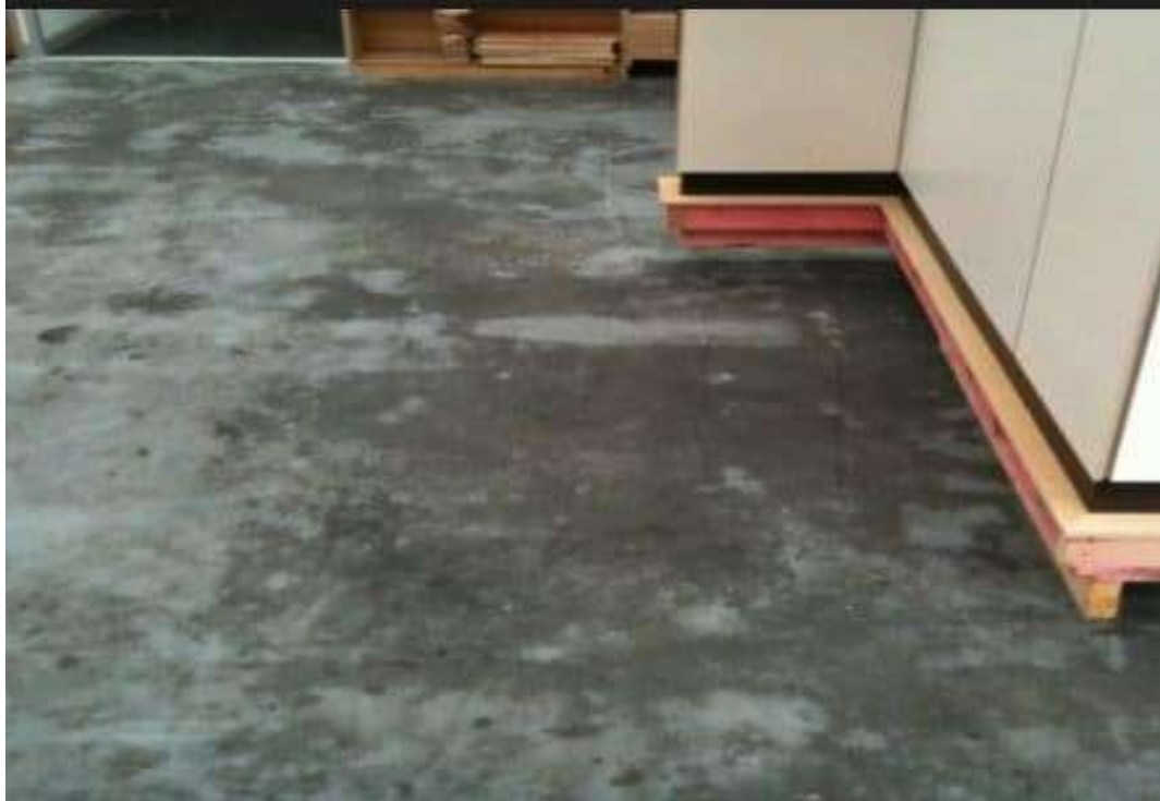
Fig 6: Dampness on Concrete Surface