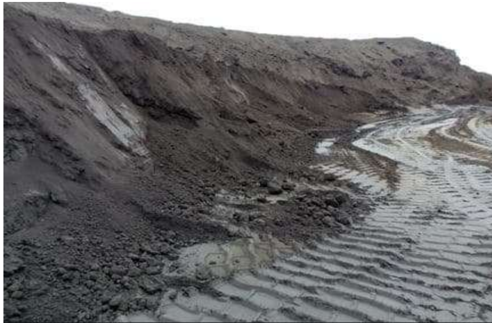
Fig 5: Fly ash