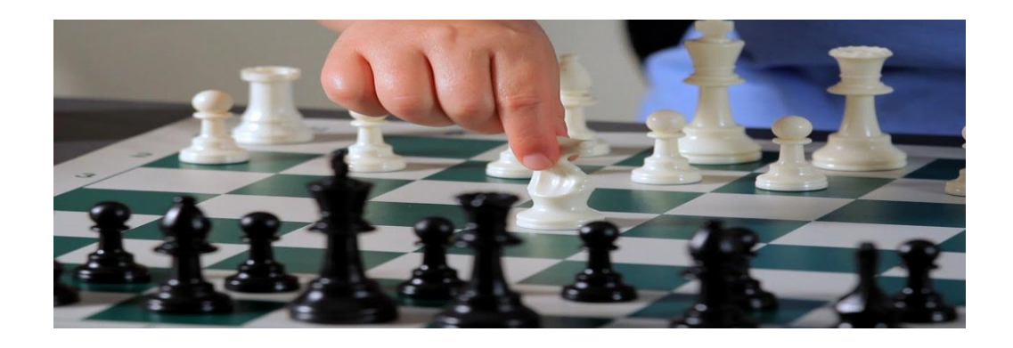
It is only possible if they play with other people

1.Brain Teaser Question: Two people played chess 5 times. Both of them won the same number of games and there was not a single draw. How could this happen?