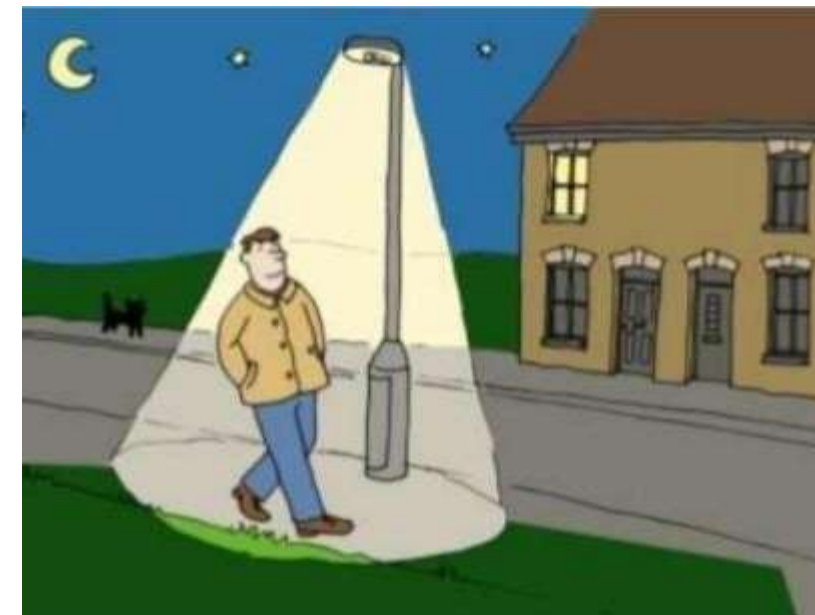
The meaning of the idiom

An idiom is a group of words that have a special meaning when used together. The meaning of the idiom is different from the meaning of the individual words. Shakespeare used and invented lots of idioms.