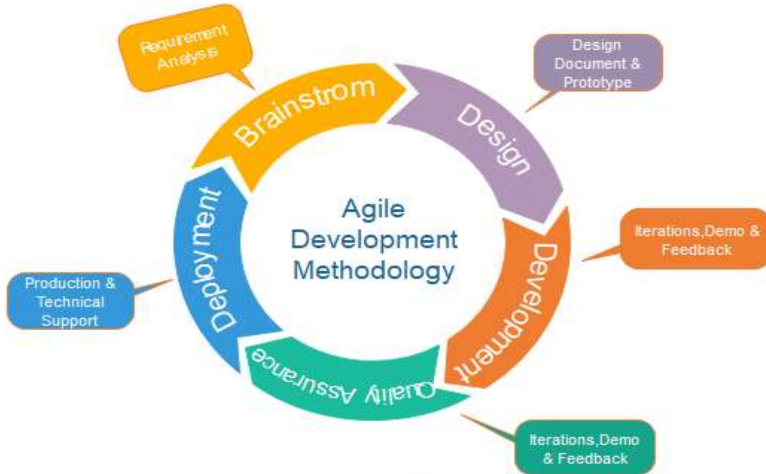
Fig. Agile Model