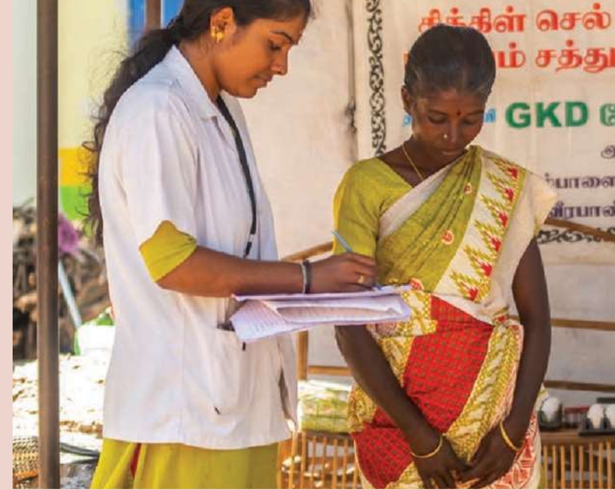
Treatment Based Beneficiaries Details